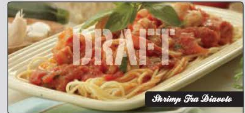
Shrimp Fra Diavolo

Shrimp Fra Diavolo shrimp sautéed in a spicy marinara, served over linguine 19