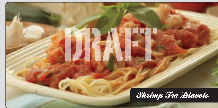
Shrimp Fra Diavolo

Shrimp Fra Diavolo shrimp sautéed in a spicy marinara, served over linguine 19